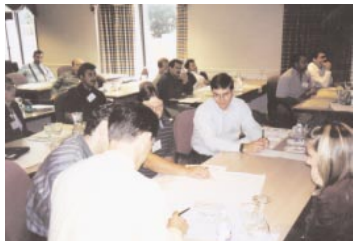
Conference Participants Study Warning Labels

BIFMA's team of experts in the area of product liability law worked together to bring the industry its third conference on this subject. Meeting in Chicago on October 11 and 12, specialists advised company representatives on legal threats and best practices for communicating the proper use of products.